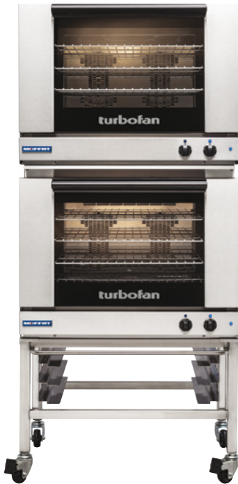
Model E28M4/2C shown

Double Stacked on a Stainless Steel Base Stand